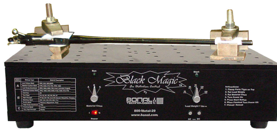
Ruger M-77, 7 mm magnum, complete assembly on the Black Magic System for processing. After processing, the firearm had a 48% Tightened Hole Grouping. Black Magic® will improve performance, increase accuracy and extend barrel life.